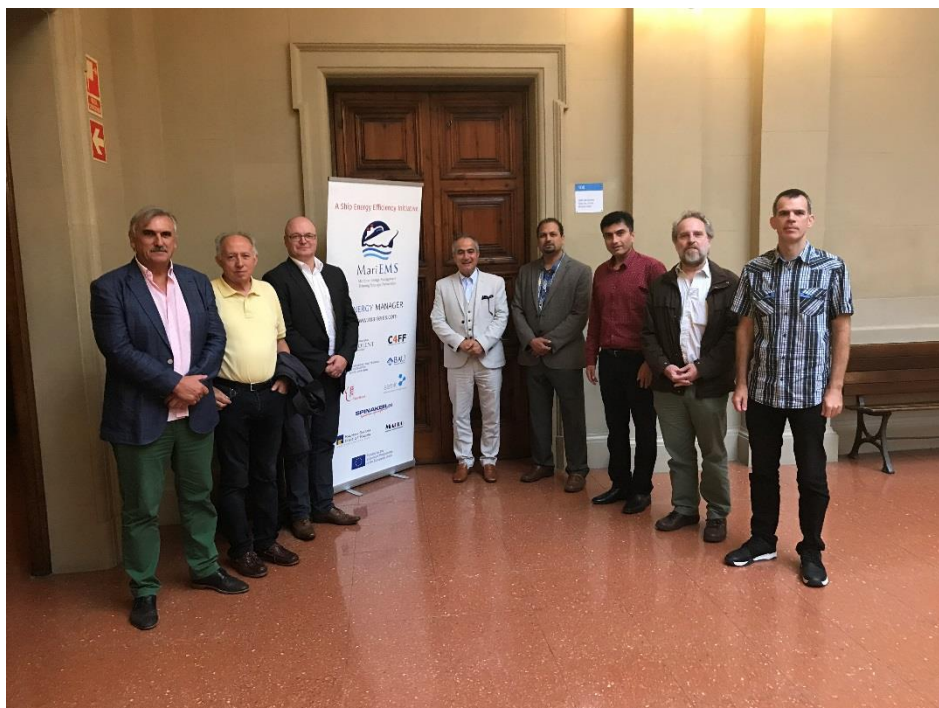
MariEMS Partners at the multi-plier event